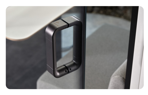
EXCEPTIONAL ACOUSTIC COMFORT

High Class A acoustic comfort according to the ISO 23351-1:2020 standard for office acoustic booths.