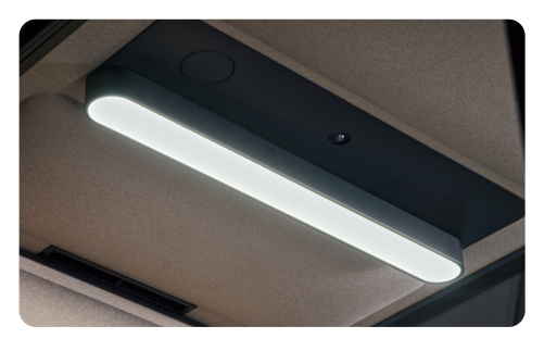
EVEN BETTER LIGHTING FOR AN EFFICIENT WORKPLACE

The new in-pod ventilation system circulates the air in the pod even faster for optimal working conditions.